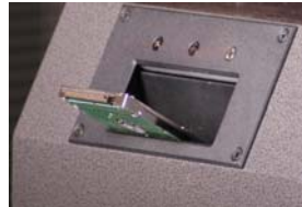
Laptop Hard Drives