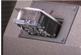
Large Hard Drives