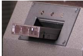
Tape Cartridges DLT, LTO, 8mm